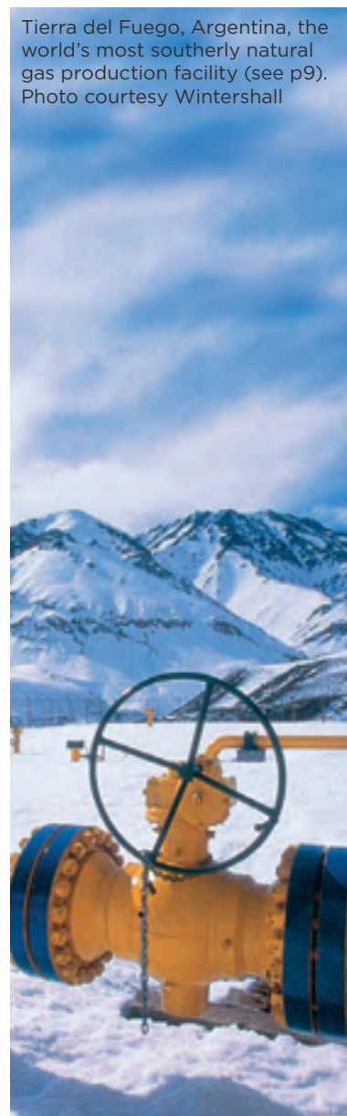
Tierra del Fuego, Argentina, the world's most southerly natural gas production facility (see p9).